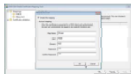
GSW SSH Server for Windows Certificate to User Account Mapping Tool

“ The Certificate to User Account mapping tool for Digital Certificate Authentication is the biggest thing to happen to a Windows SSH Server since GSW provides a true End to End FIPS 140-2 compliant option to the United States Military ”